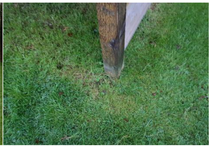
Action: Monitor for any deterioration (rot) and replace as required