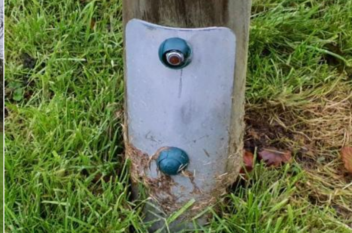
Finding: There is/are bolt cap covers missing or damaged on the item