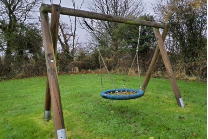
Finding: There is/are bolt cap covers missing or damaged on the item

Risk Level: V - Very Low Risk Surface: Grass Matrix Tiles