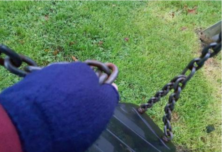
Action: Monitor for any further deterioration and replace when 40% worn