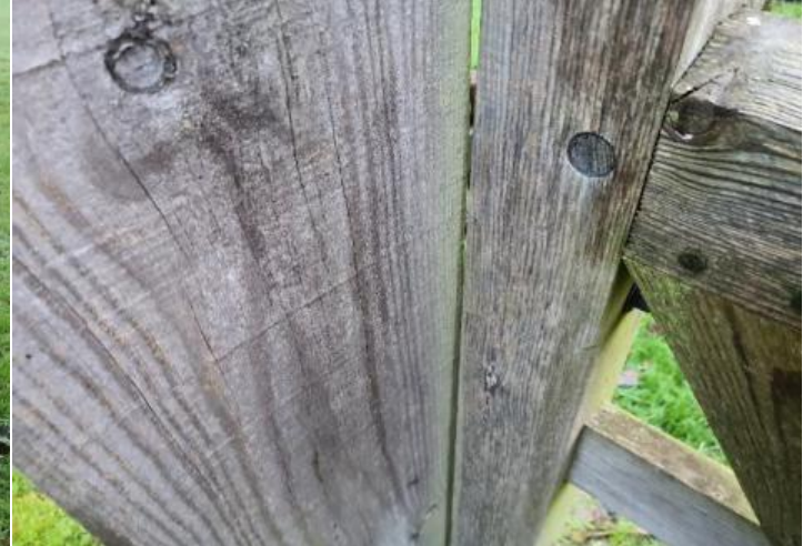
Finding: There are openings that are less than 12mm that could trap or crush fingers