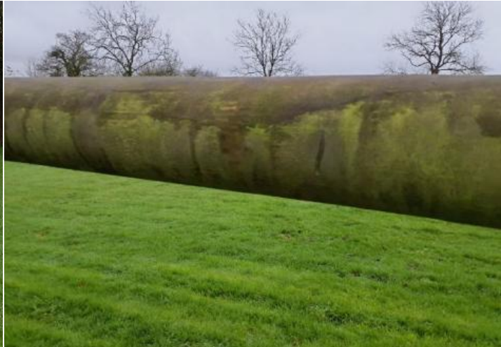
Finding: There is algae or moss on the surface of the items Action: Clean and treat appropriately inspected