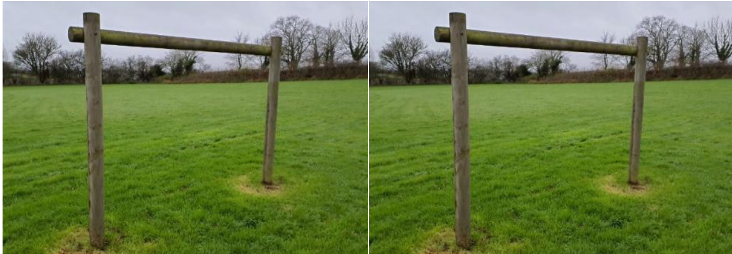
Finding: NB: We have undertaken a maintenance inspection only of the football goal(s); full load testing falls outside the scope of our inspection. Action: In

Manufacturer: Not Identified Surface: Grass