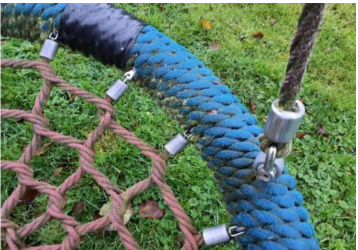
Action: Monitor for any further deterioration and repair or replace as required