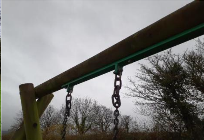
Action: Contact the Play Inspection Company office for further information