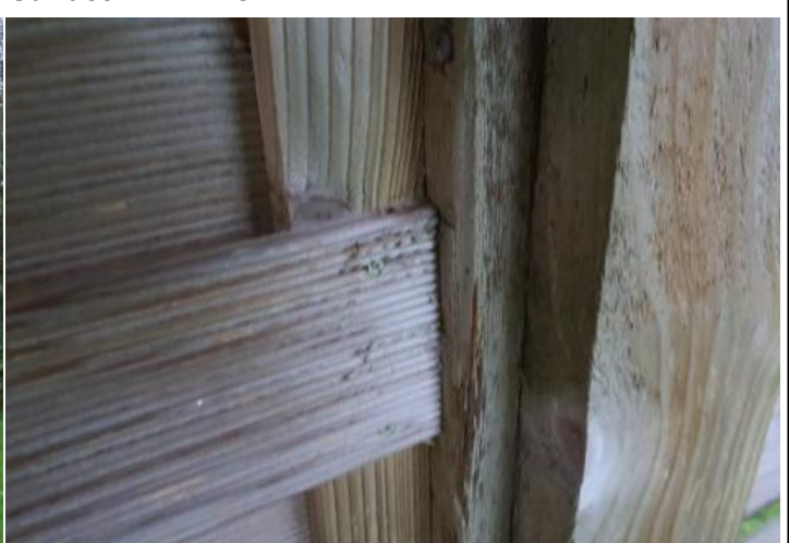
Action: Remove all rough or sharp edges