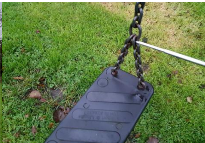
Finding: The chain openings are in excess of the 8.6mm as Action: Monitor - No remedial work recommended recommended by BS EN 1176