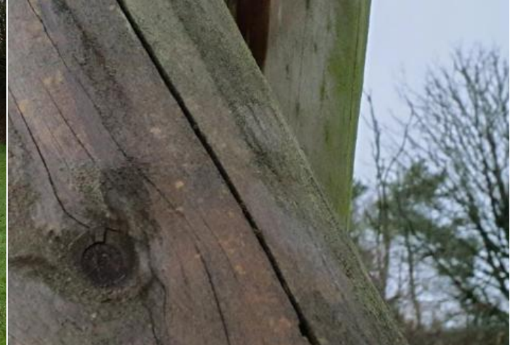
Finding: The timber elements have a number of splits/shakes or air cracks and this may affect the stability or fixing points of the structure and/or cause any instability allow water ingress which will accelerate the rotting process