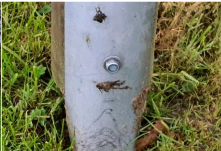
Action: Replace missing or damaged bolt cap covers