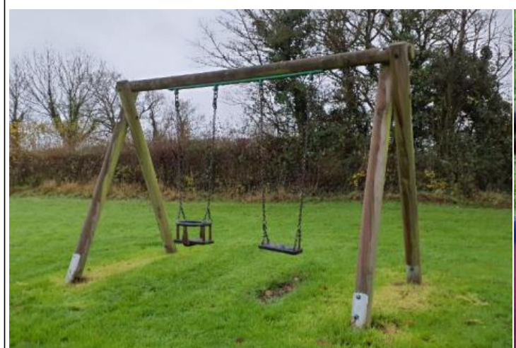
Finding: There is some notable evidence of chain wear

Item:Swings - 1 Bay 2 Seat SwingRisk Level:L - Low RiskManufacturer:GL JonesSurface:Grass Matrix Tiles