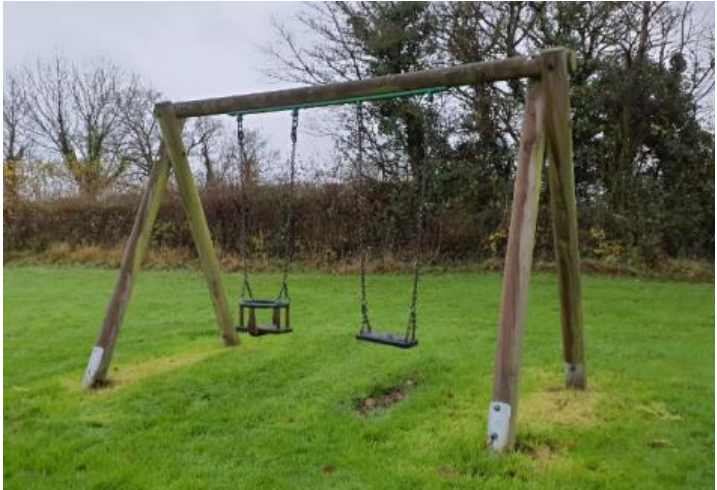
Finding: The inspector has some concerns about the internal condition of the timber cross bar (timber discolouration may indicate internal rot) and was unable to verify the structural integrity without further testing. We recommend a Resi-PD survey to establish the condition of the timber at it's core.