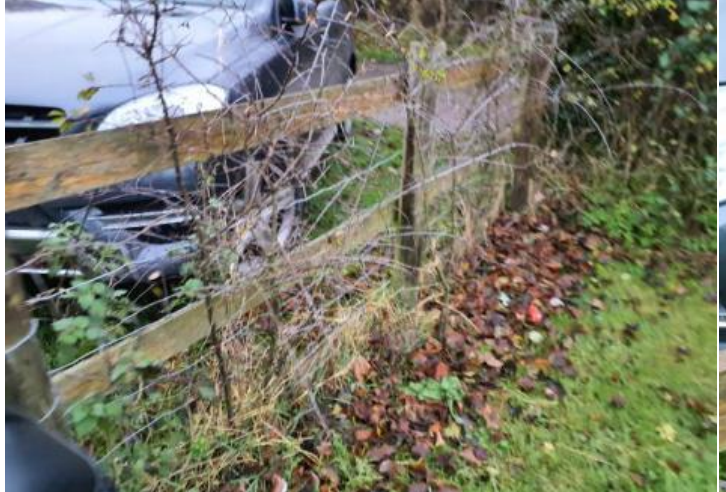
Finding: There are areas or parts of the timber on the structure that have rotted

Item:Fences - Fence - Timber & Mesh InfillRisk Level:L - Low RiskManufacturer:Not IdentifiedSurface:Grass