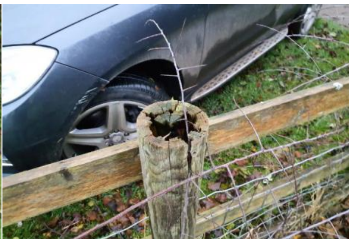
Action: Replace all affected timbers