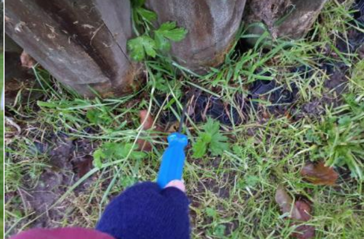
Finding: There is some evidence of rot in the timber