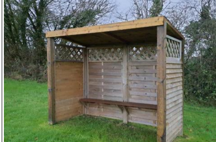
Finding: Parts of the timber are rough or splintered

Item:Ancillary Items - Seating AreaRisk Level:L - Low RiskManufacturer:Not IdentifiedSurface:Grass